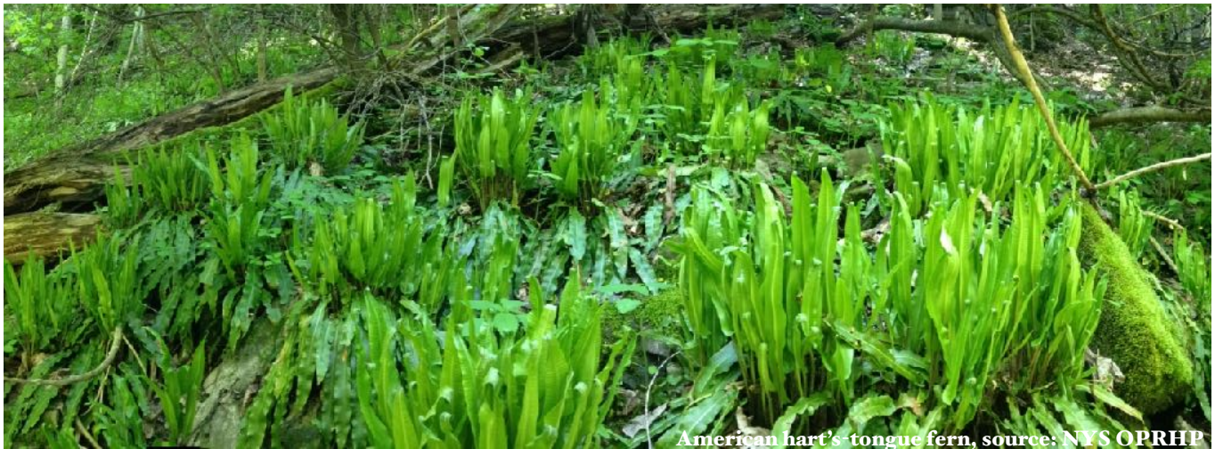
American hart's-tongue fern, source: NYS OPRHP