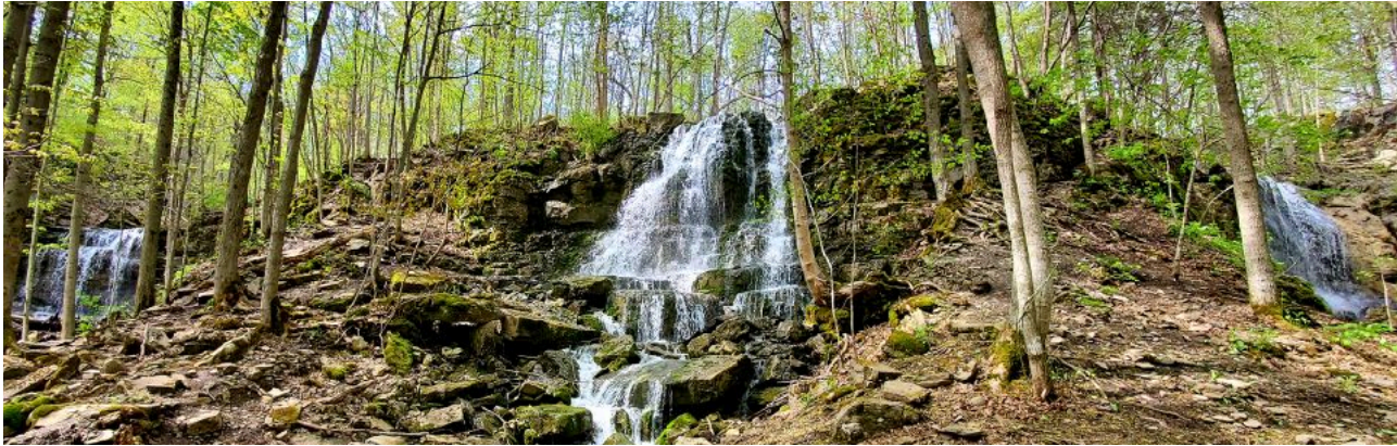
Three Falls Woods.